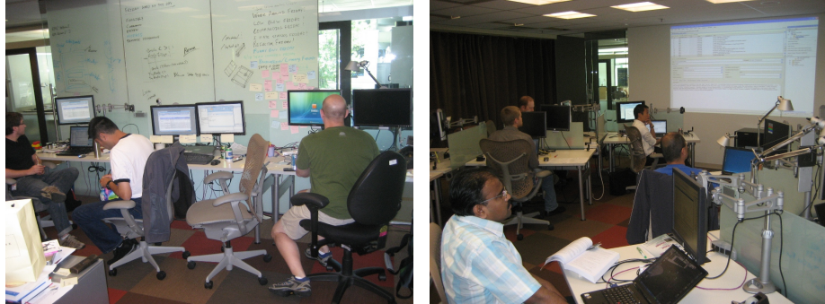
Fig. 1. Shared team rooms for the two software teams we observed.

studies [10,17] and questions motivated by our in situ observations, the interviews focused on the following aspects: