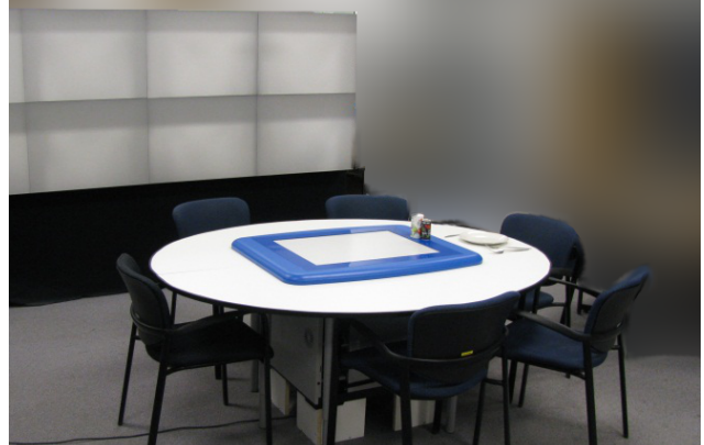
Figure 2. A general view of the LunchTable

The interface is implemented in C# on Windows 7 using WPF. Microsoft's Desktop Window Manager API is used to control windows on the large display as well as to replicate windows on the horizontal surface. Elements in the horizontal surface are implemented using the SMART Table SDK.