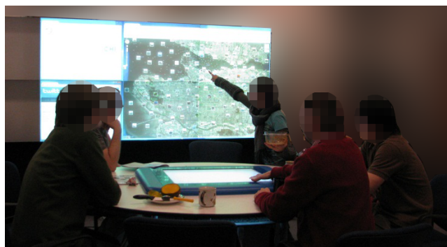
Figure 1. A group of people at the LunchTable.

This paper contributes: a) the design of a multi-user, multi-display interface to support casual conversations during lunch breaks, b) a description of a multi-display system that implements the interface in an existing lunch space, and c) our reflections on the design based on results from a weeklong observational study of its real-life use.