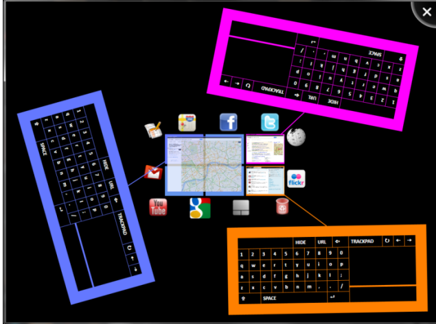
Figure 4. The window manager in the center of the horizontal display shows the wall-display contents (see Figure 3) and is surrounded by an application launcher. Virtual input devices have been opened for controlling each of the three windows.

Windows are manipulated by dragging their thumbnails. Several windows can be manipulated simultaneously. A window can be moved to another tile by dragging it and releasing it in the center of another tile. If the release point is in between two tiles, the window will expand to occupy the adjacent tiles (see Figure 5). This mechanism allows people to move and resize a window in one single-finger gesture. This design was preferred to the standard pinch gesture because two-finger interaction becomes harder at a distance.